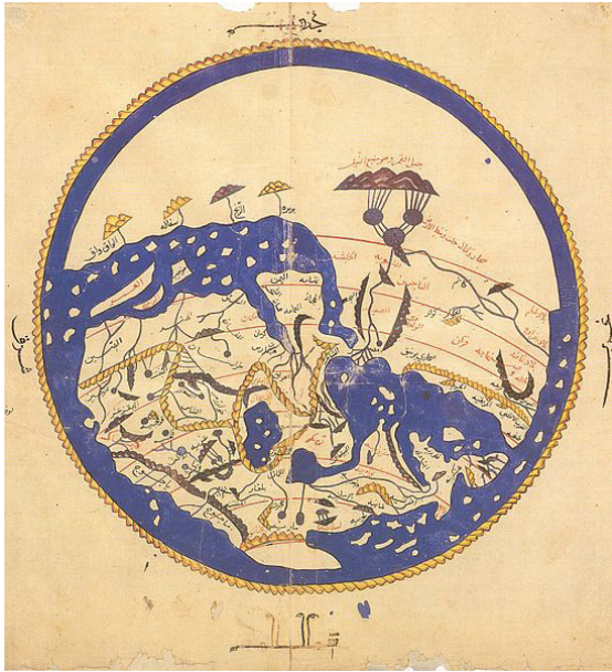
Figure 1: Al-Idrîsî, Nuzhat al-mushtaq fî ikhtirâq al-âfâq ( Journey of one who is eager to traverse horizons 4 )