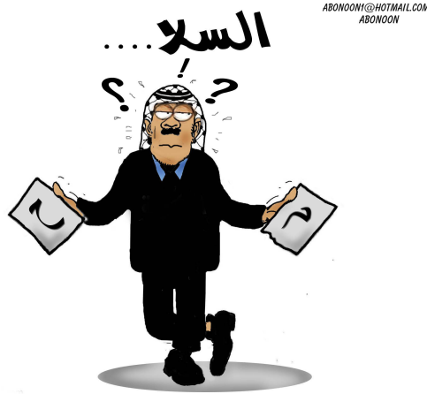
Figure 3: As-Salam (Peace) or As-Saleh (Arms)?